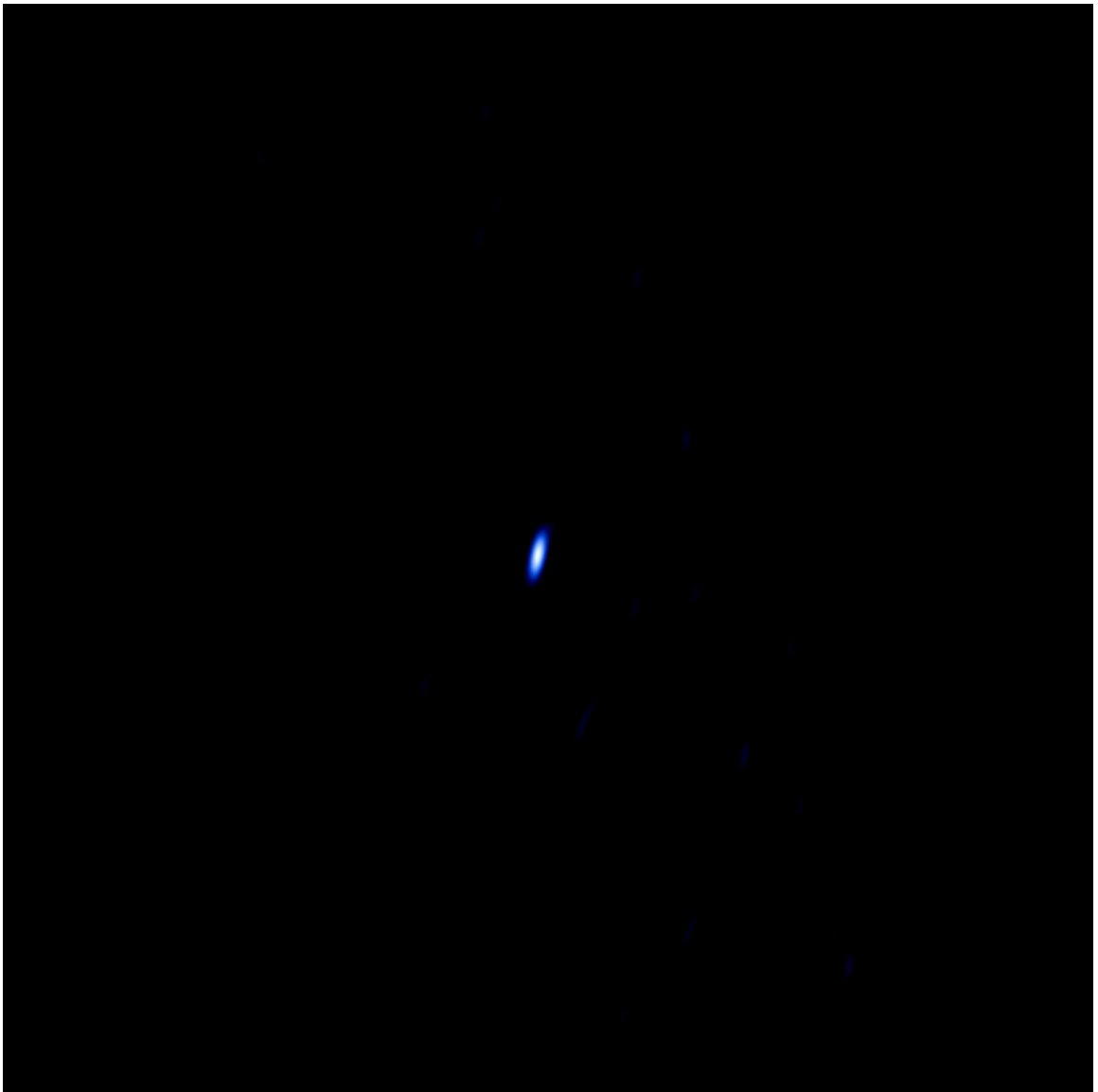
Figure 4: Radio image of Voyager 1 from Earth, 2012