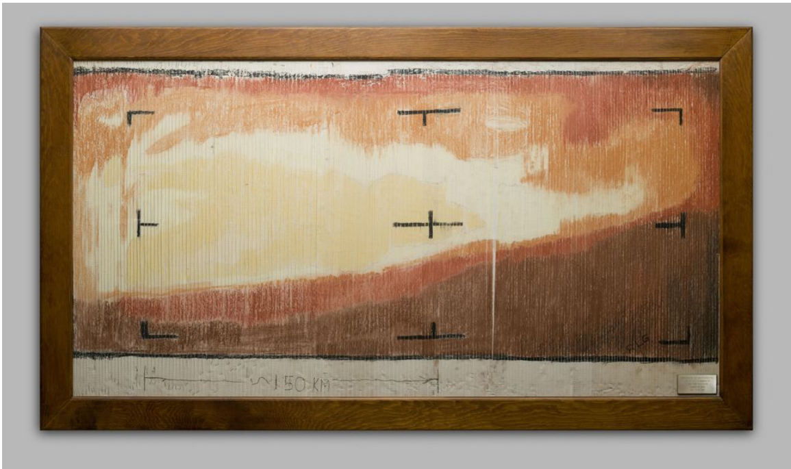
(Figure 1) First TV Image of Mars (Hand Colored), 1964